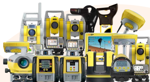
GEOMAX AUTHORIZED DISTRIBUTION PARTNER

* Optimal conditions to Kodak Grey Card (90% reflectivity) ** IR-Quick mode *** >500m: 4 mm + 2 ppm **** At 50 m distance ***** Optional tested polar version, standard -20°C to 50°C ***** Battery time may be shorter depending on conditions. All trademarks and trade names are those of their respective owners.